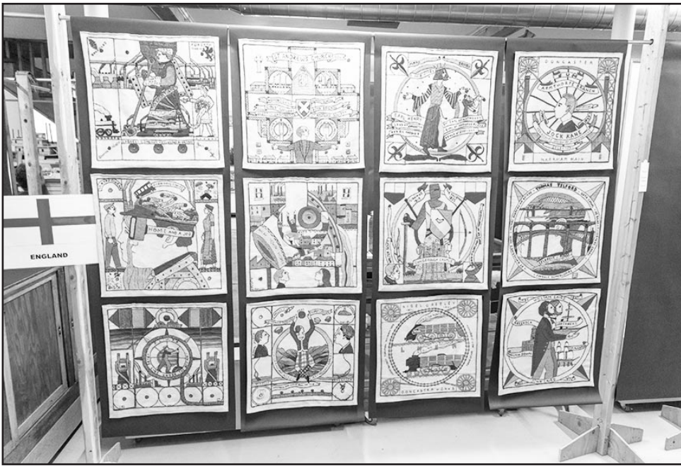
A collection of 304 hand-stitched tapestry panels, created by people all over the world, are now on display at Vaughn Hall in downtown Montello. The panels depict the accomplishments of Scots who emigrated around the world - and two panels were created right here in Marquette County!