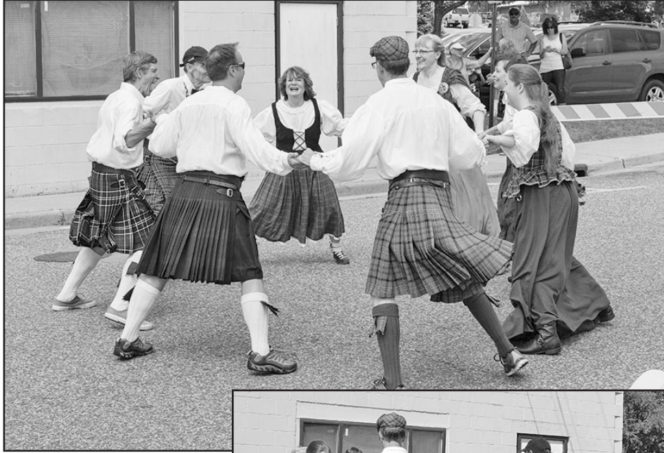
Scottish country dancers entertained visitors to Scottish Fest, while clan tents provided information about Scottish family lines.