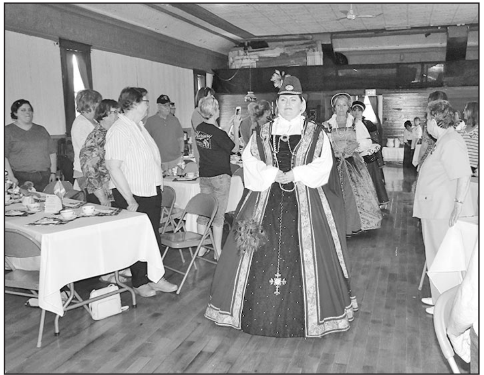
Mary, Queen of Scots arrives for tea. Those attending went home with souvenir vintage teacups and beautiful tartan plain napkins!