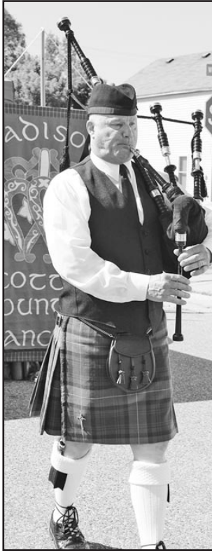
The sound of bagpipes filled downtown Montello on Saturday morning for the opening ceremony of the Scottish Diaspora Tapestry Exhibit, going on now through July 30th at Vaughn Hall.