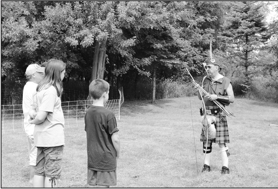
Visitors enjoyed a longbow demonstration at Rendezvous Paddle & Sports.